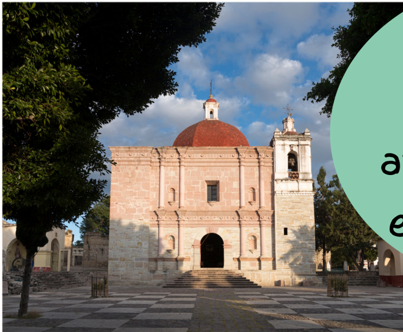
Church in Mitla, Oaxaca, Mexico.

47% of the population attends church every week.**