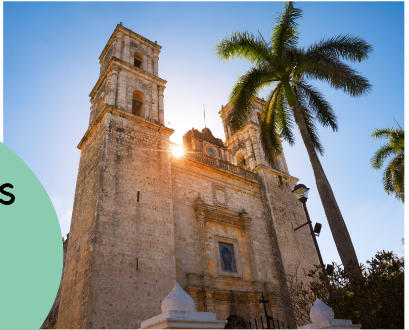
Valladolid San Gervasio Church of Yucatan.